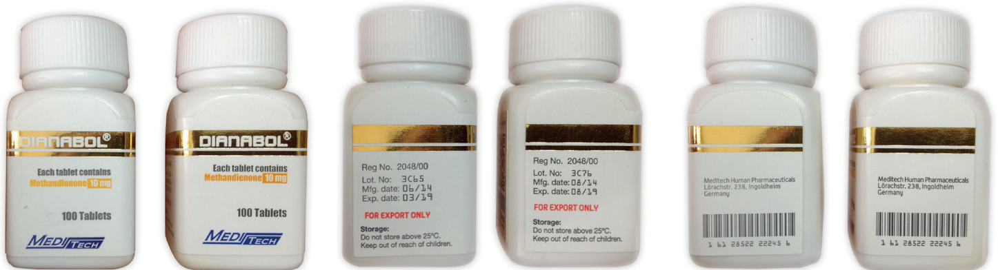
Left: Old package / Right: New package

2. Product information text on the label changes from light grey to black.