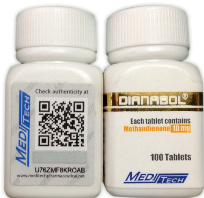
Final package (have Authenticity)